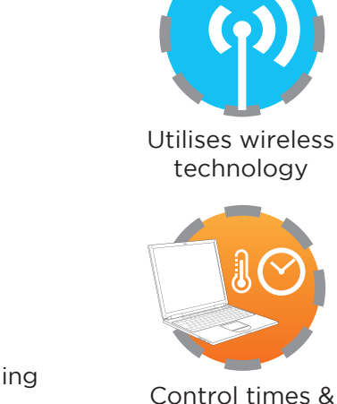
Control times & temperature remotely